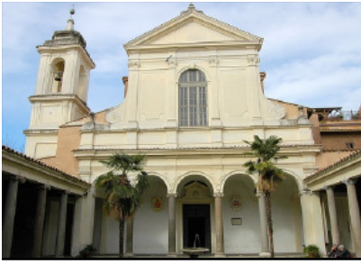
San Clemente Church