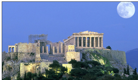
Acropolis in Athens