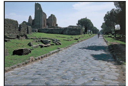
Ancient Roman Roads