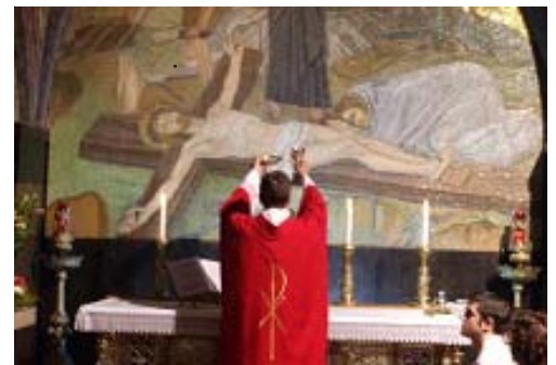
Mass at Calvary