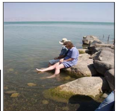
Meditating on the Sea of Galilee