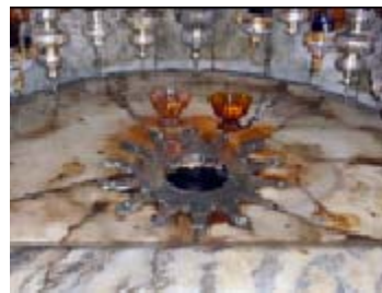
Location of Jesus' birth in Bethlehem