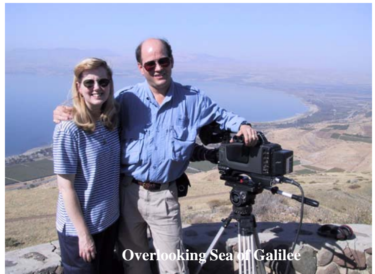
Overlooking Sea of Galilee

We personally invite you to join us on this trip of a lifetime!