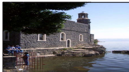
Primacy of St. Peter's Church