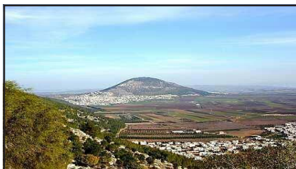
Mount of Transfiguration